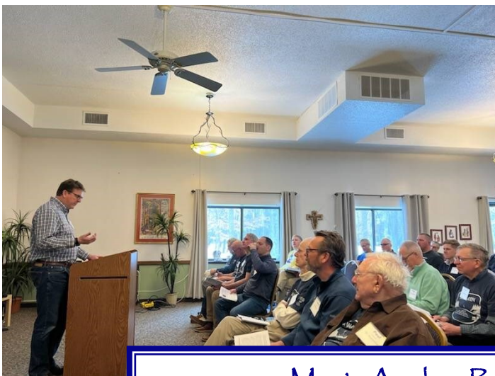
Men's Awaken Retreat Last Weekend