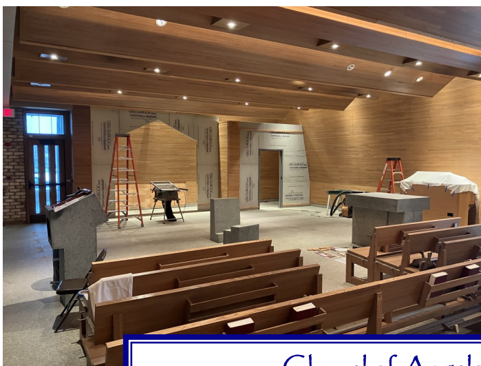
Chapel of Angels Renovation Update