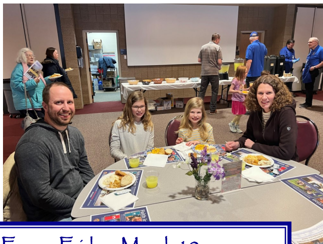
Knights of Columbus Fish Fry on Friday, March 10 The next Fish Fry will be on Friday, March 31