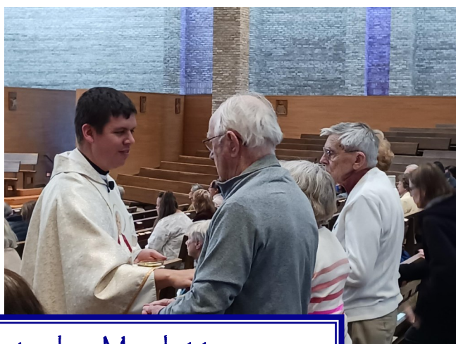
Anointing Mass ~ Saturday, March 11