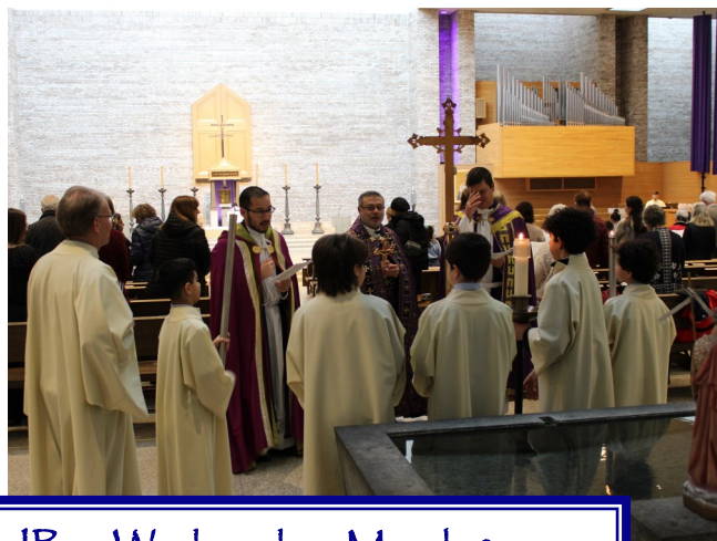
Maronite Divine Liturgy at SJB ~ Wednesday, March 8