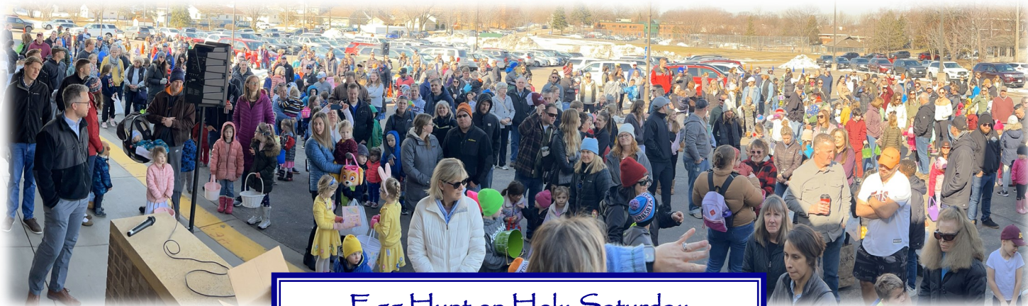
Egg Hunt on Holy Saturday