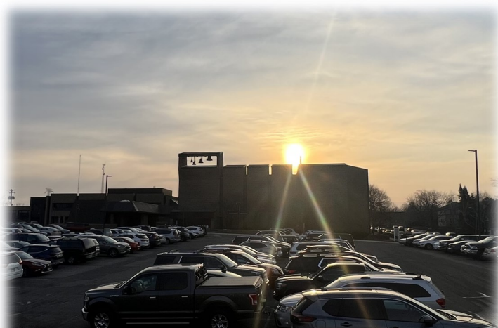
Easter Morning Sun over SJB