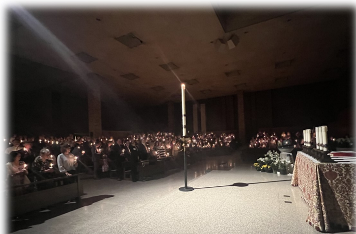
Easter Vigil on Holy Saturday