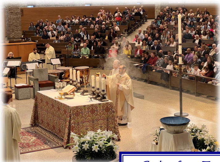
Sights from Easter Morning Mass