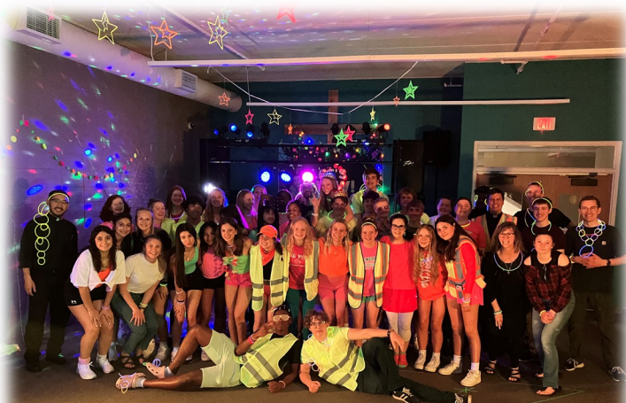
SJB Youth "Neon" themed Prom on April 14