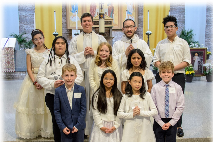
SJB Students enrolled in RCIC received their First Holy Communion on April 16