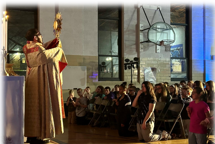
SJB Middle School Jesus Night on April 21