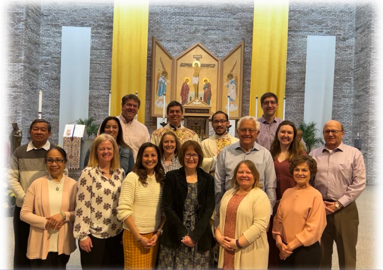
Some members of St. John's Synod Evangelization Team after the 10:30 am Sunday Mass this past weekend