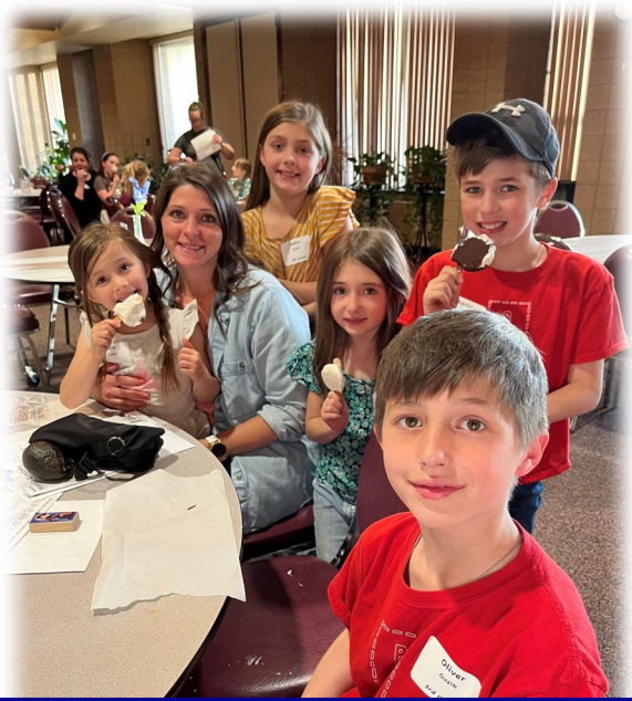
Family Formation pictures from our May Session Ice Cream Social and Salvation History Walk Through Collage