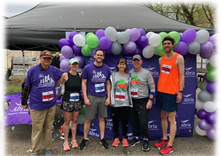
Group from St. John's that participated in the Abria Pregnancy Resource Center's Fun Run on Saturday, May 13