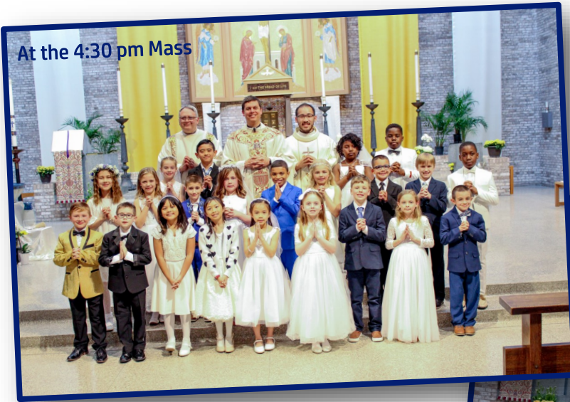
At the 4:30 pm Mass

Congratulations to our 53 children who received the Lord in the Eucharist for the first time! Know that Jesus is with you, and may you always journey with Jesus!