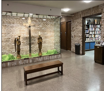
The Library is up the ramp across from the Archives case.