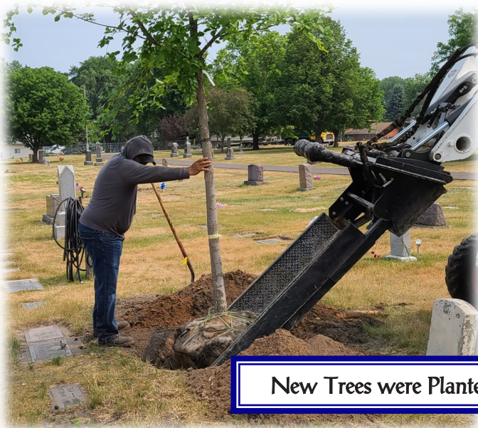
New Trees were Planted in the St. John's Cemetery