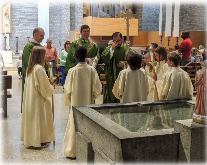
New Altar Server Installation at Mass on June 15