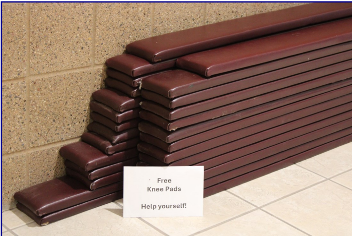
Free kneeler pads from the church—help yourself!