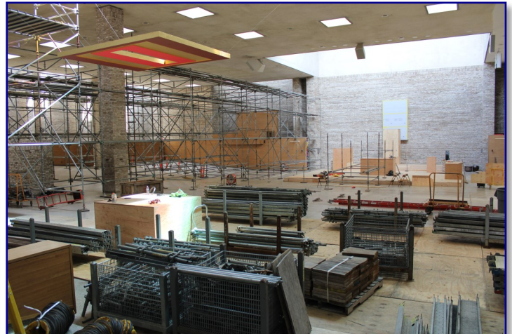
More scaffolding going up in the church