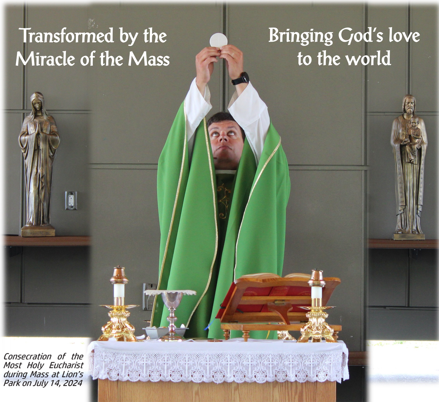
Consecration of the Most Holy Eucharist during Mass at Lion's Park on July 14, 2024